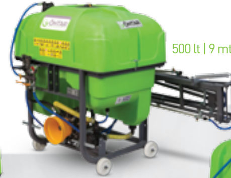
500 lt | 9 mt