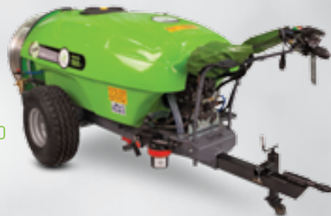
1000 lt | Q90