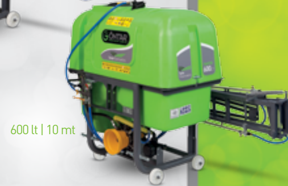
600 lt | 10 mt