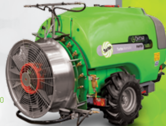
1600 lt | Q90