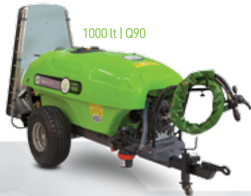
1000 lt | Q90