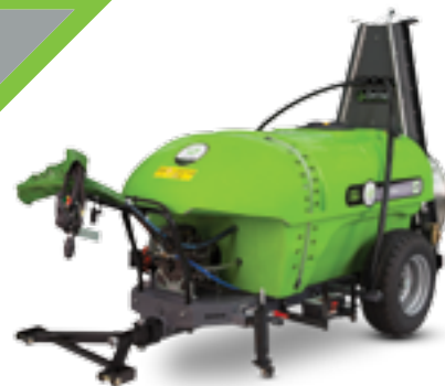
2000 lt | Q90