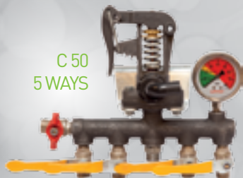
C 50 5 WAYS