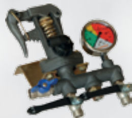
C 50 3 WAYS