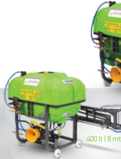
400 lt | 8 mt