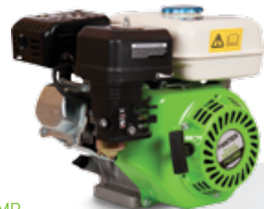
6,5 HP GASOLINE