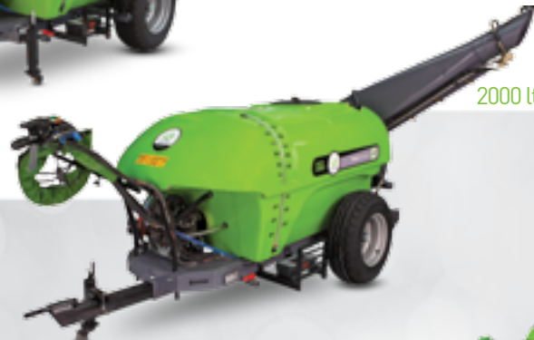
2000 lt CANNON