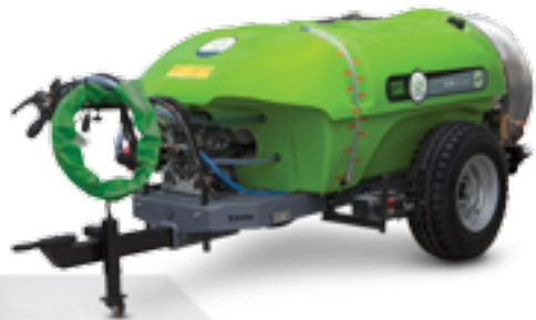
1600 lt | Q90