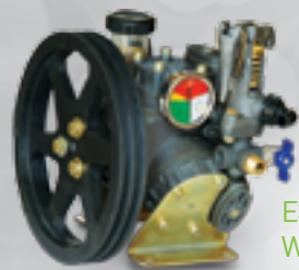
E30 WITH PULLEY