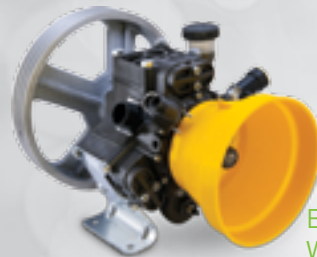
B80 WITH PULLEY