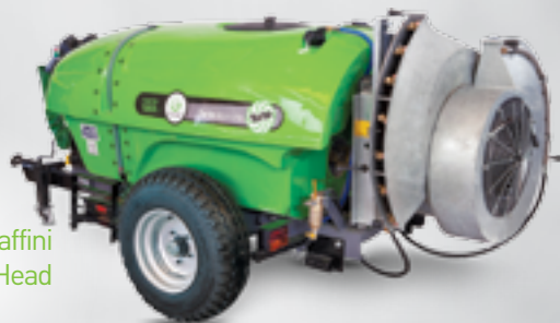
2000 lt Caffini Orchard Head