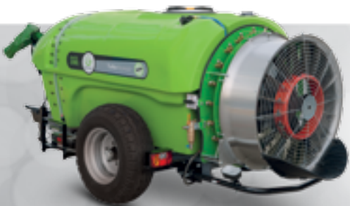
2000 lt | Q90