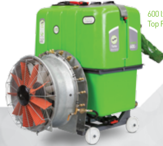
600 Lt Caffini Top Fan