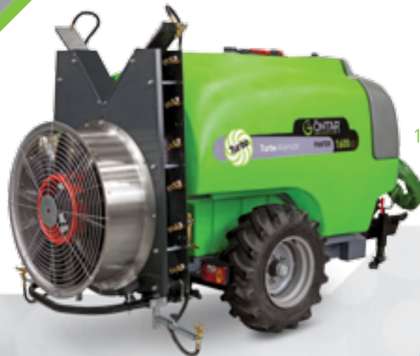
1600 lt | Q90