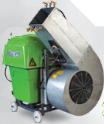
600 Lt Caffini Cannon