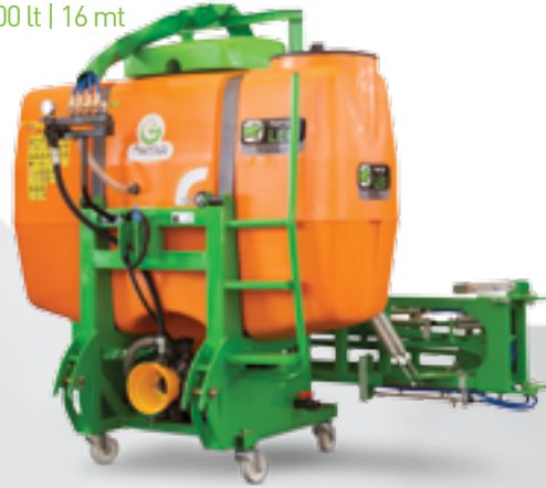
1000 lt | 16 mt