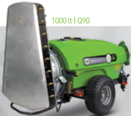
1000 lt | Q90