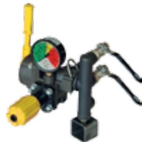
VDR 50 3 WAYS