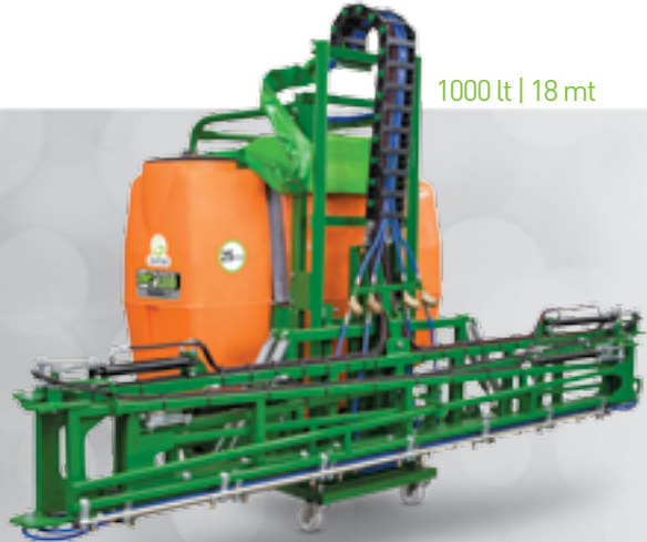
1000 lt | 18 mt