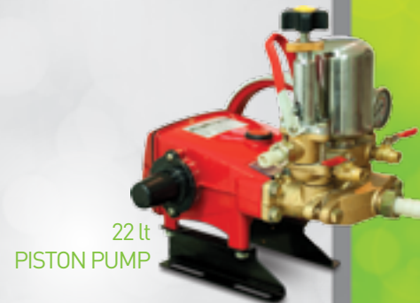
22 lt PISTON PUMP