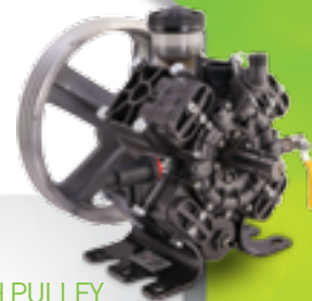
A105 WITH PULLEY