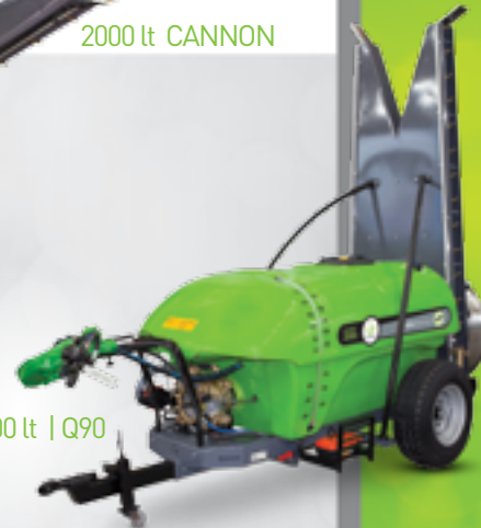
2000 lt | Q90