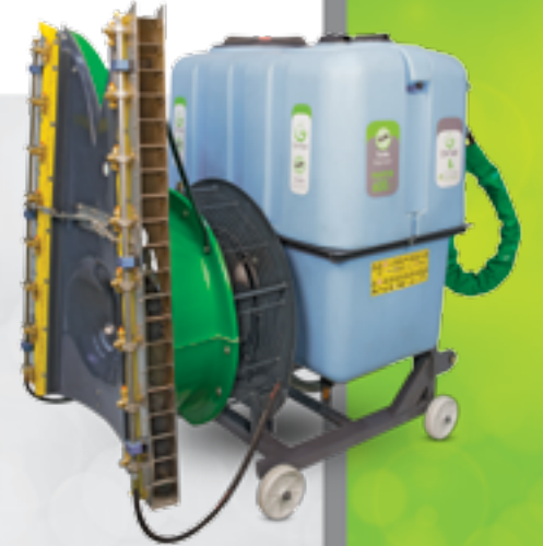
600 Lt Caffini Synthesis Fan