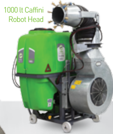
1000 Lt Caffini Robot Head