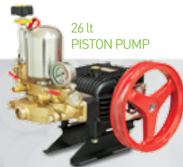
26 lt PISTON PUMP