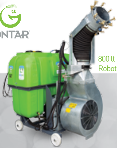
800 Lt Caffini Robot Head