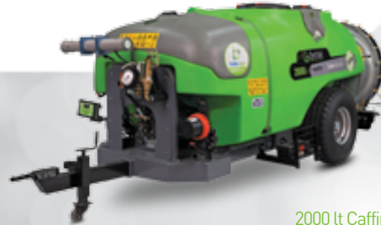
2000 lt Caffini Reverse Fan + Sensor